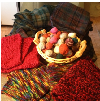
Pictures of the catnip balls and blankets worked on during the June meeting, and some of the lucky recipients at the Humane Society

The Programs Chair will be shared by 3-4 members, each to cover a three month period. A suggestion sheet for things members would like to learn was passed at the meeting, and an email asking for ideas will be sent out as well. We're always looking for interesting program and project ideas.