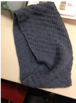
Sally's cowl made from recycled denim yarn