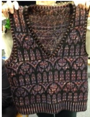
Sue's breathtaking vest