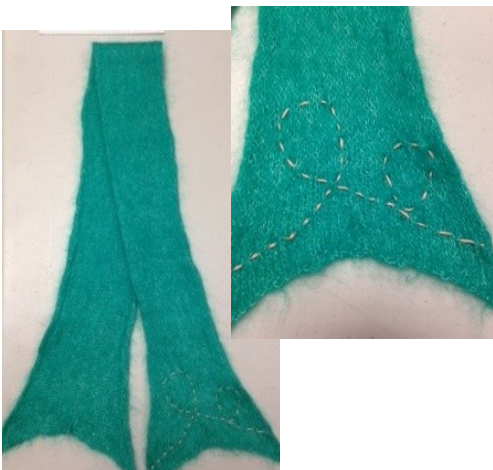
Linda's felted mohair and merino scarf with detail embroidery