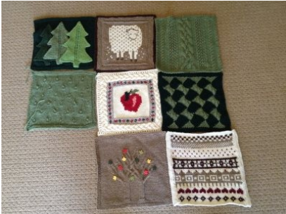
More afghan squares completed!