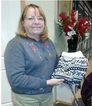
Marlene—Faire Isle sweater for a very large dog