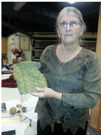
Victoria—wool and silk cowl