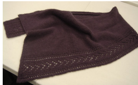
Lace edge wrap/scarf by Marilee