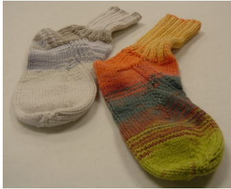
Terrific striped socks!