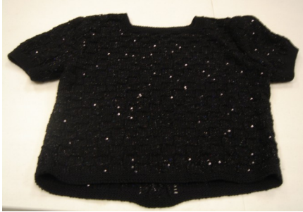
Black sequined sweater by Judy