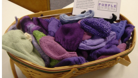
Basket of newborn purple hats for CASA