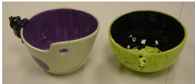
Yarn bowls—you can make one at 'Inspirations'