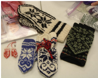
Fair Isle mittens—TJ, you're so talented!