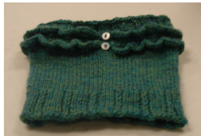
One of Chantel's boot toppers