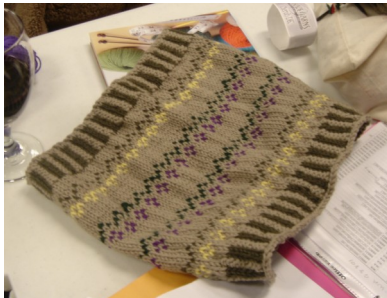
Two of the cowls made during the recent Fair Isle class